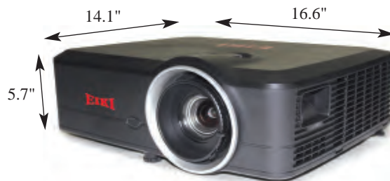
EK-600U • WUXGA • 1-chip DLP® projector. EK-601W • WXGA • 1-chip DLP® projector.