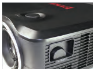
Easy vertical and horizontal shift controls.