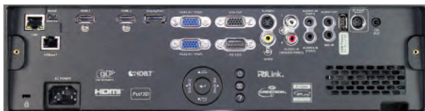
Includes a full complement of connections, including network control.

High Contrast, Vivid Colors, 1-Chip DLP® Technology. Cost-Effective Large Venue Performance. Crestron RoomView™ & AMX Device Discovery Technology.